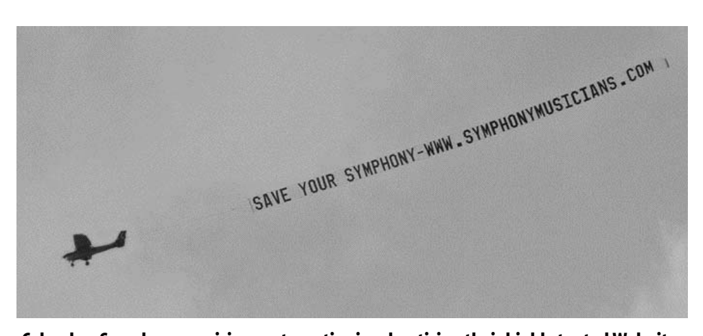
Columbus Symphony musicians get creative in advertising their highly touted Web site.

[Editor's Note: The above letter was submitted for publication well before the media summit that took place in Chicago on February 21, 2005. When it became apparent that this issue would be delayed, the letter was published on Orchestra-L in advance of the media summit, where it prompted thought and discussion. Expect to read more about the media summit in the next issue of Senza Sordino.]