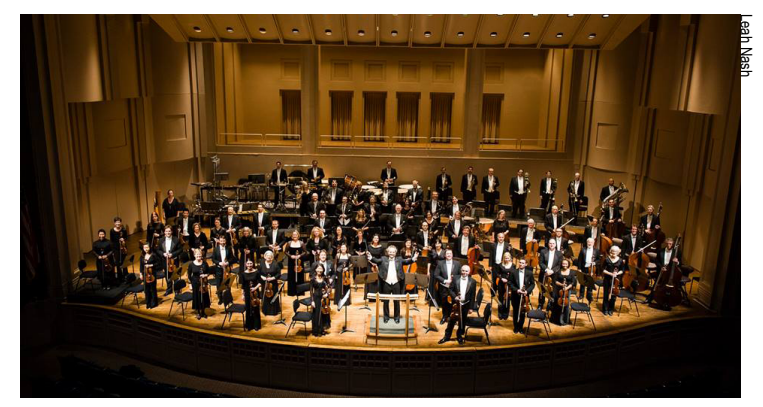
The Oregon Symphony

The past few years have seen the orchestra budget grow by