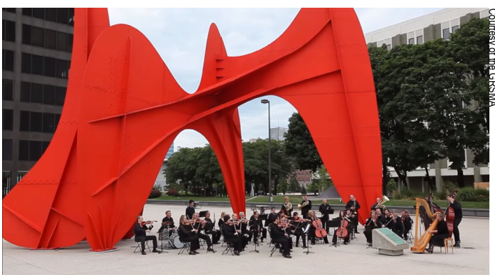
Still from Grand Rapids Symphony Musicians Association video

Looking back to the events that unfolded this time, the positive outcome of these negotiations in Grand Rapids could be attributed to the many ways in which the musicians used social media. (continued on page 15)