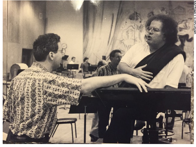
The author with Levine

Levine has a voracious musical curiosity, which is often more evident in our MET Orchestra and chamber music performances. While the challenging economics of opera seem to make more adventurous programming daunting, these other settings allow opportunities to explore the most current