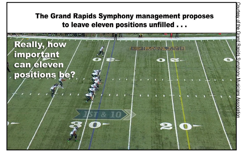
A post from the GRSMA Facebook campaign

We needed to focus upon issues that were most important to our membership, and it was decided to do so through social media. On Thanksgiving of 2015 we launched our Facebook