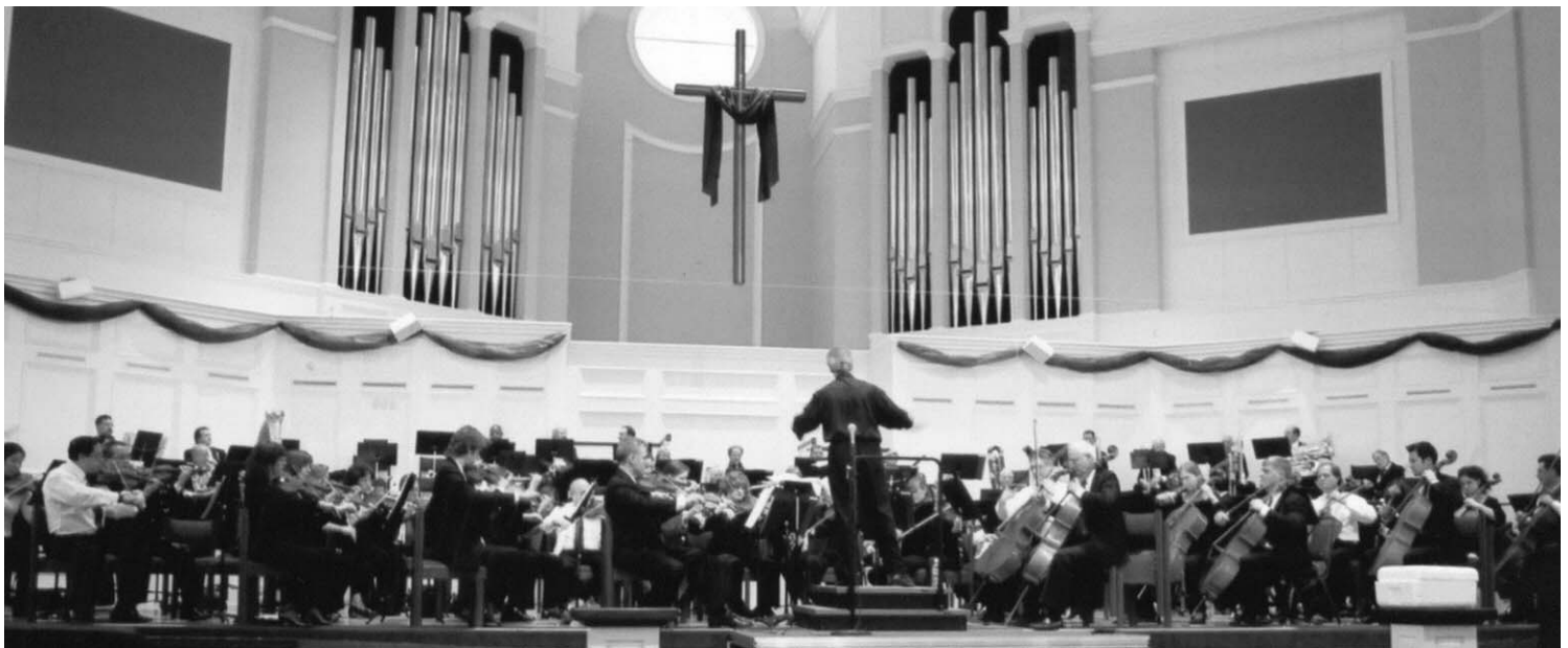
In rehearsal for the Combined Orchestra Solidarity Concert in St. Louis, March 13, 2005