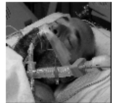
Author, December 29, 2004, four days before health insurance is cut off

On December 27 the meetings began again, just about the time I dragged myself into the hospital with an aorta about ta blow. A week later I stumbled out, with a pig valve in my chest 'n some purty impressive doctor tattoos on my abdomen—just in time to find my health insurance and paycheck missin'. Now those hambres were gonna make us dance, pardner!