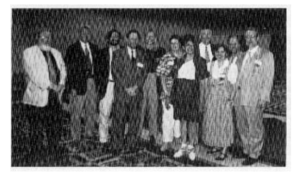
Representatives from ICSOM, ROPA, OCSM, and RMA gather in Las Vegas