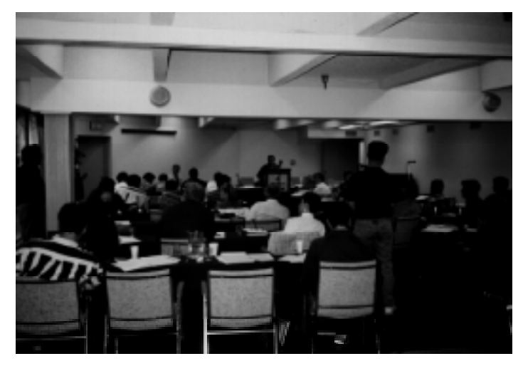
Delegates to the 1994 ICSOM Conference in session

Be It Resolved that the delegates to the 1994 ICSOM Conference strongly endorse the incorporation into model contract language of the following principle: that there shall be clear restrictions on the initiation of dismissal procedures with regard to the beginning and ending of a music director's tenure with the orchestra.