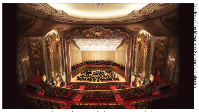
An artist's rendering of the renovated theater

MSO supporters are excited about the project because it means more scheduling autonomy for the organization, and