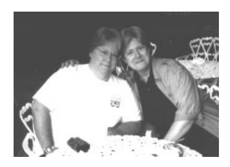
The All-Powerful ICSOM Secretary takes the Perfectly Powerless Senza Editor under her wing at the AFM Convention.

At the 1999 AFM Convention, the bastions of resistance finally began to visibly give way to our years of chiseling at the rock. From the first day of the Convention,