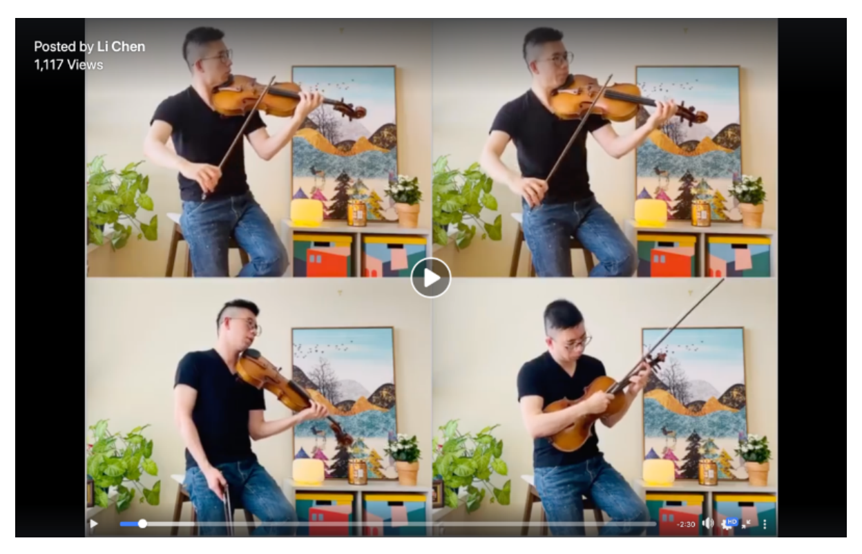
Musician visible, both bow arm and left hand. Beautiful, colorful background with good lighting.

If you have made it this far, here are some examples of good visual quality.