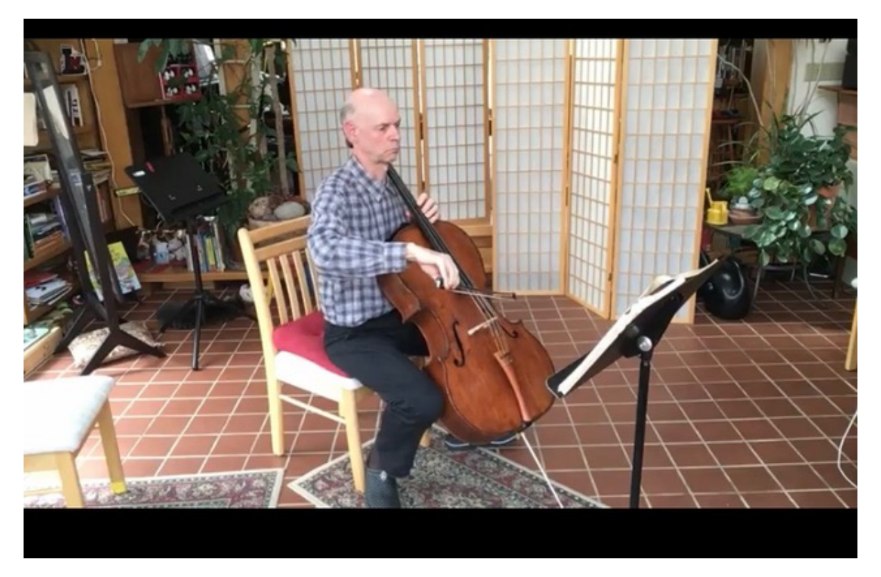
Again a nice background with good lighting. Also clear that this is someone's home workspace with another stand in the background.